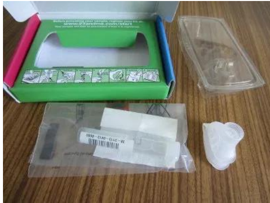
A test kit from 23andMe

the killer's relatives and submitted the results onto an open database called GEDmatch. GEDmatch was created in 2010 as a way for individuals using different genetic and familial testing companies (such as Ancestry.com or 23andMe) to download their raw data from their tests and upload it to a public database for a wider comparison with other consumers to test for potential relatives.