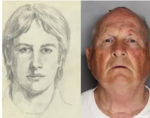
The composite sketch of the "East Area Rapist" from the 1980s and Joseph DeAngelo.

For people that support familial DNA testing, it would be morally wrong not to let these private databases (like Ancestry.com or 23andMe) be used to try to solve crimes, as it would allow for more criminals to be caught. Families of victims from decades-old cases demand resolution and will want to use anything to attain justice, no matter how